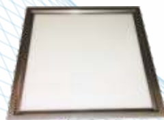
LED Grid Lights