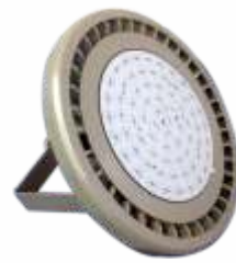
LED Flood Lights